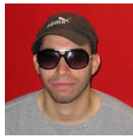
No hats or sunglasses